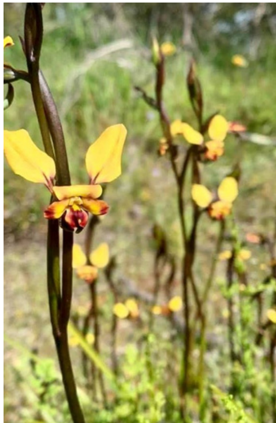
Donkey Orchid found at Yeerakine Rock

Kondinin Cottage is thought to be the oldest surviving home within the township. Built in 1923 of whitewashed mud bricks and mud mortar by early settler Frank Boehm. The cottage consists of 4 main rooms, which are all being protected by large verandas. It was restored in 1995 but can only be viewed from the road as it is private property.