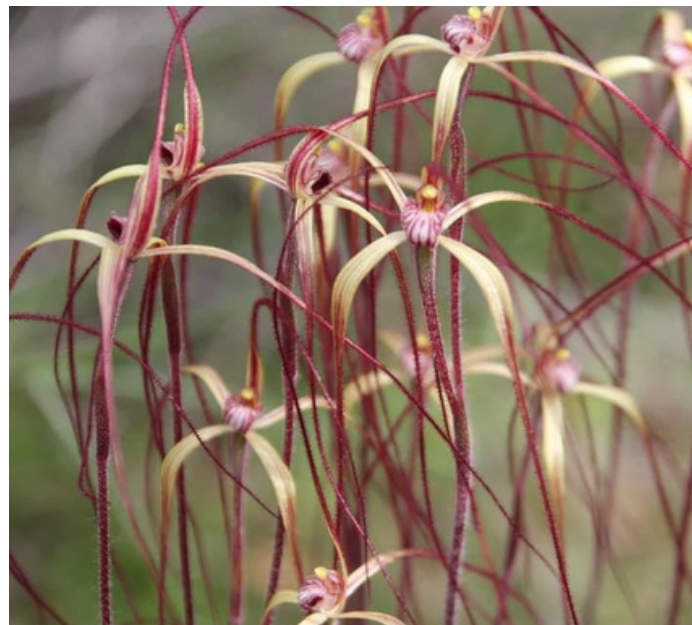
Spider Orchid found at Yeerakine Rock