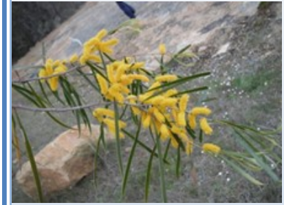
Acacia acuminata Raspberry Jam Wattle. Wood smells like raspberry jam when cut. Very durable wood used by farming pioneers for fence posts and sheep yard posts.