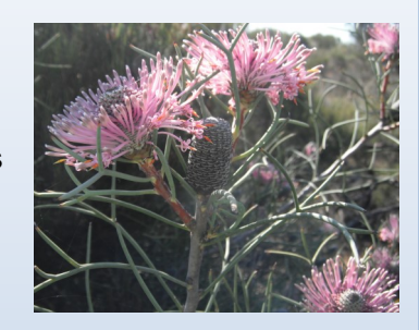
Isopogon teretifolius Nodding Cone Flower Flowers are rose-pink and clustered together to form a flowerhead and the end of the branches. They droop downwards once open.

Across the road from top car park you may see