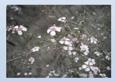
Leptospermum erubescens Roadside or Wheatbelt Teatree White or pale pink flowering shrub