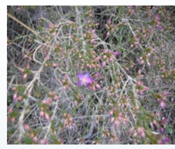
Calectasia Tinsel flower