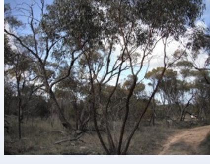
Eucalyptus loxophleba York Gum are the dominant eucalypt species in the Sheoak woodland surround Yeerakine Rock.