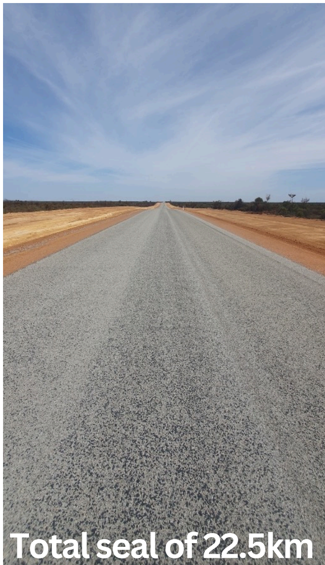
Total seal of 22.5km

The Hyden Norseman Road seal has now been completed. The Shire of Kondinin appreciates everyone's assistance whilst the road was closed to ensure these works were completed in a timely manner. This project was made possible through grant funding from the Federal Government Department of Infrastructure, Transport, Regional Development and Communications and the Shire of Kondinin